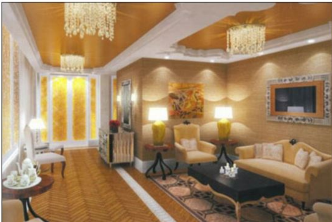
Fine rugs, chandeliers and mirrors feature heavily in the numerous sitting areas throughout the building