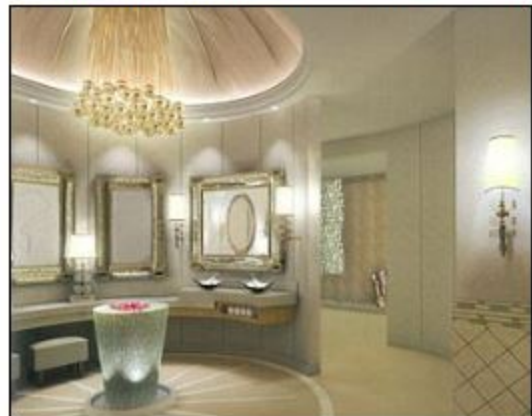
Each floor of the tower is made from different materials to give an individual look. Numerous powder rooms and reception areas lead off the lobby which has nine elevators

Seen at a distance, the two buildings are strikingly similar, with soaring columns, large sea-facing windows and a nearly identical jigsaw puzzle facade.